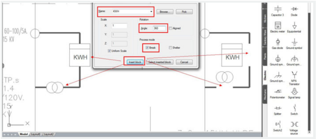
Wipeout: Wipeout background object(s) when a block reference is overlapped.